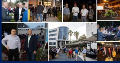
Business 2 Business Event