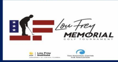
Modeling & Simulation Hall of Fame